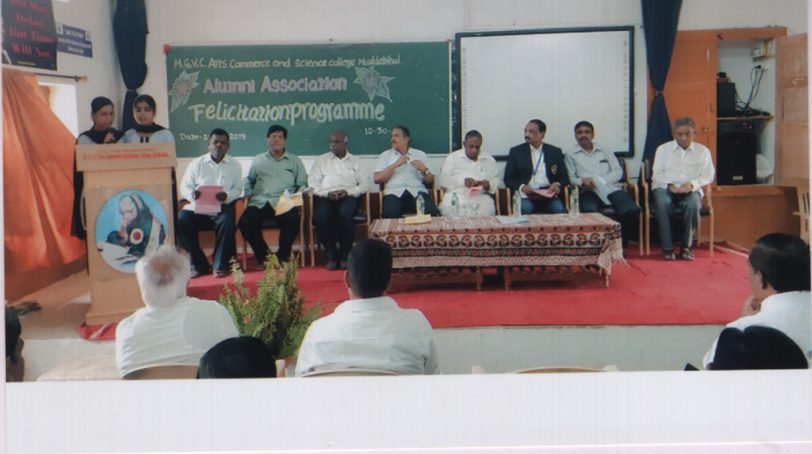
Alumni Association Programme.