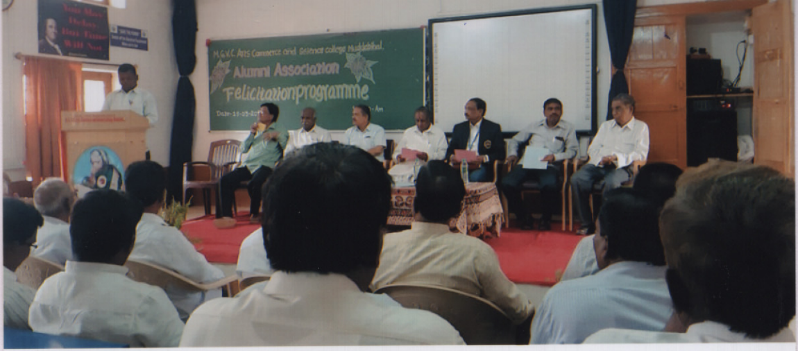
Felicitation programme of Alumni on 15.3.2018