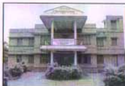
Outer View of Library